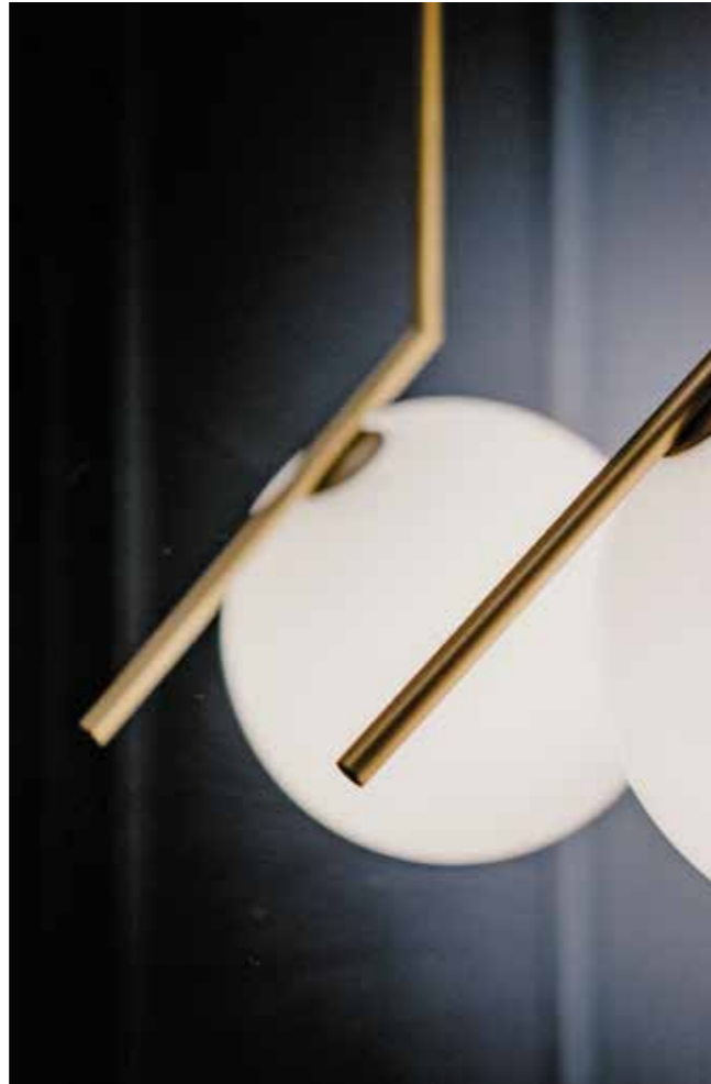
Meticulous detailing and hand-picked pieces enhance the elegant aesthetic throughout the apartment.

The detailing is meticulous: bespoke cabinetry with inset lighting, leather covered cabinet doors with visible stitching, a wood panelled “waffle” ceiling in the living area, inset rope lighting in the corridor ceiling, curtain rails along the seafront windows that are set into the ceiling and hidden from view.