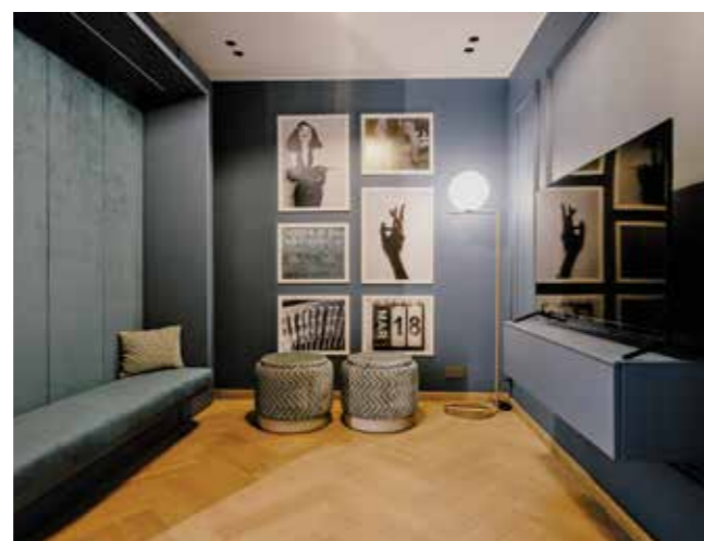
The lighting systems and fittings are an integral part of the design. Throughout the apartment, surface-mounted and track-mounted spotlights from ESS and Elektra, who also supplied many of the high-end brand fittings, create discreet lighting effects and draw attention to focal points in the various spaces.

Tucked behind the bar area, a fully fitted high-tech professional kitchen in stainless steel caters to discerning culinary needs. Additional functional spaces include a well-equipped laundry room, a convenient guest WC, housekeeper's quarters, and a spare bedroom with a TV and gaming lounge and its own en-suite bathroom.